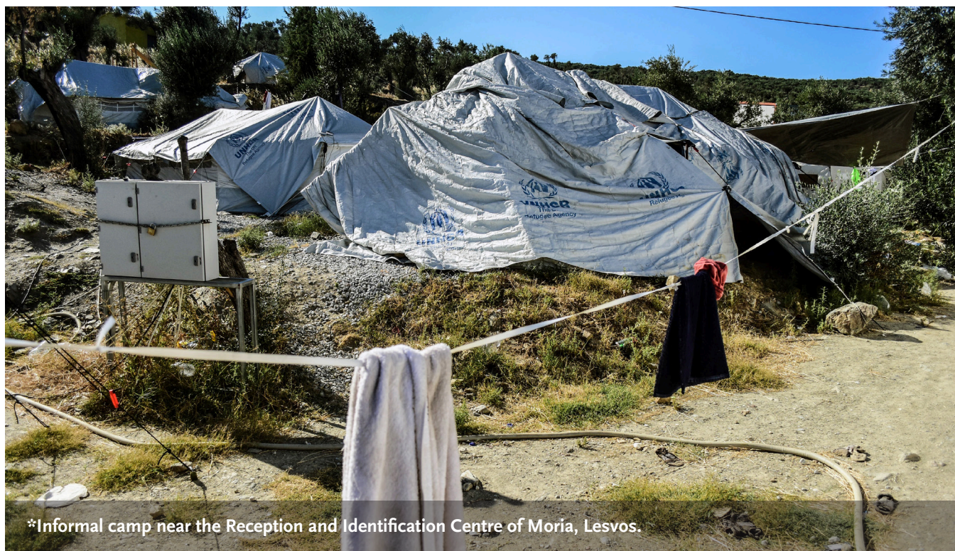
*Informal camp near the Reception and Identification Centre of Moria, Lesbos.

Izza Leghtas and Alyssa Eisenstein travelled to Greece in July 2017. RI extends special thanks to the asylum-seekers and migrants who shared their stories with us.